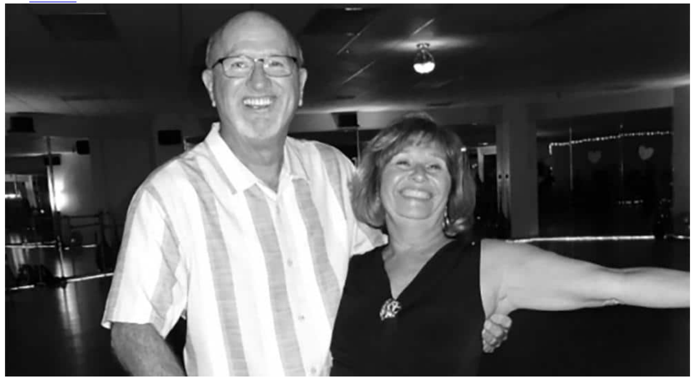
All Inspirational Stories